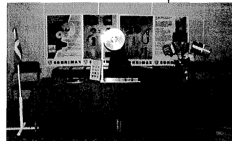
The SONNIMAX A-S booth. SONNIMAX services wheel and airblast equipment.