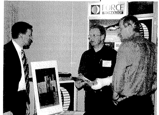
Attendees in front of the FORCE booth. FORCE Technology is one of Europe's largest knowledge and technology-based service providers.