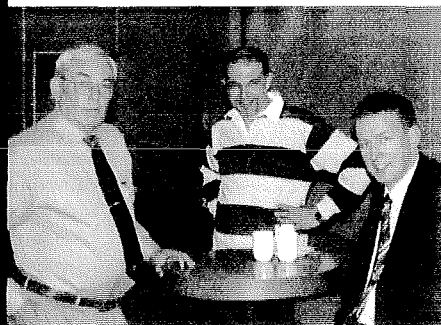
The workshop is a unique opportunity to socialize and share ideas with work colleagues in diverse fields.