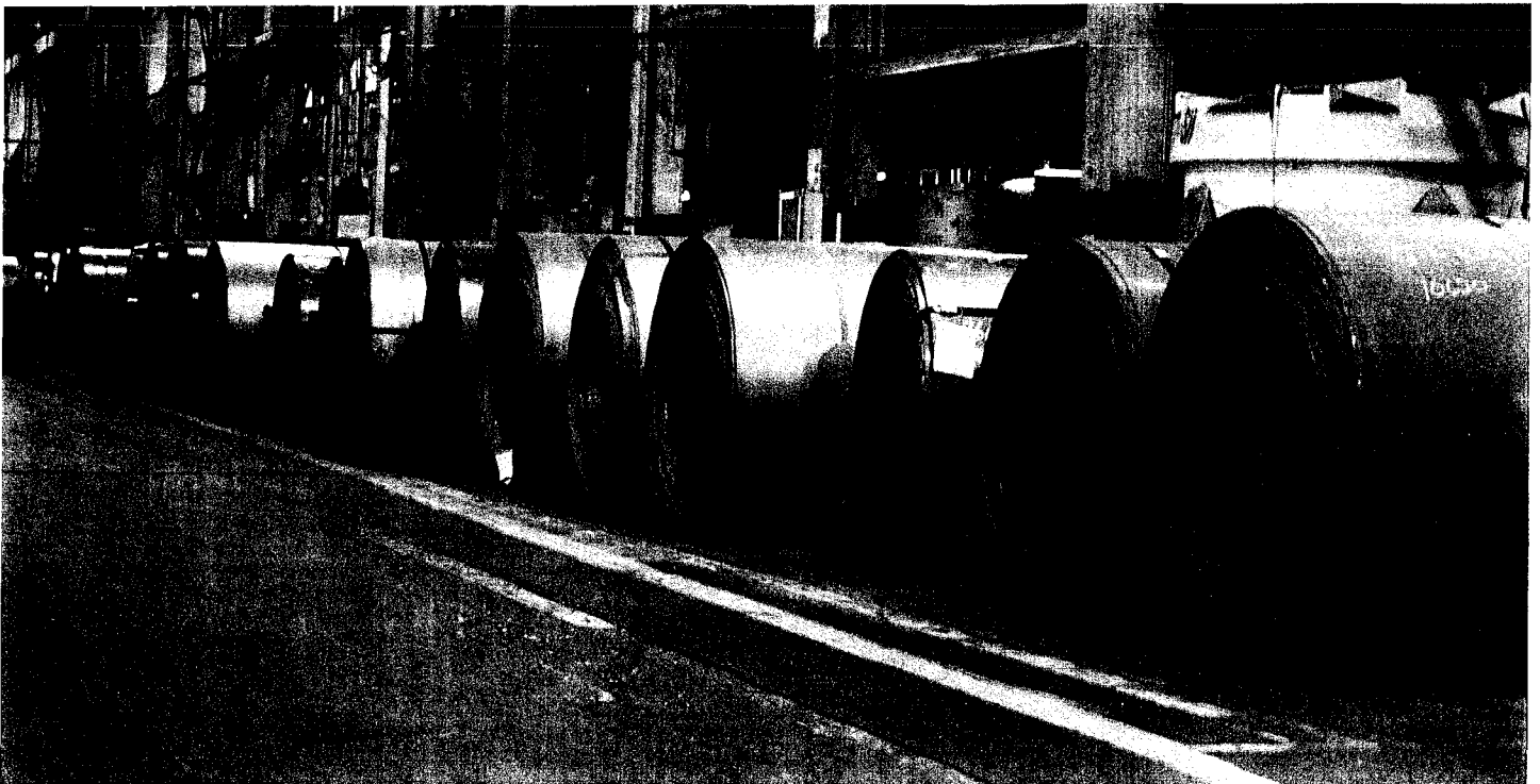
Timet is the acknowledged leader in titanium strip production. Timet strip is produced by cold-rolling titanium in coil form and can be sold either as coil or cut length and is available in both aerospace and industrial quality grades and specifications.

Now Larry always has the pleasure of watching those big coils of one of the world's most valuable metal products move through the blast cleaning process and onto the rest of his department where they will be prepped to become aerospace, automotive and architectural products used throughout the world.