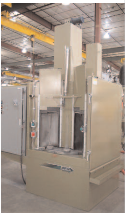
With two stations and fixtures to hold multiple parts, this semi-automated machine processes thousands of parts per day.

In the end, we were able to help the customer reduce cost by processing the parts in-house. Not only are they able to meet production demands more quickly, but also they are able to control variables, immediately respond to process issues, and eliminate the delays associated with batch processing at a distant location. They are saving time, saving money, and achieving an extremely high level of quality, making us proud to have contributed to this successful project. ●