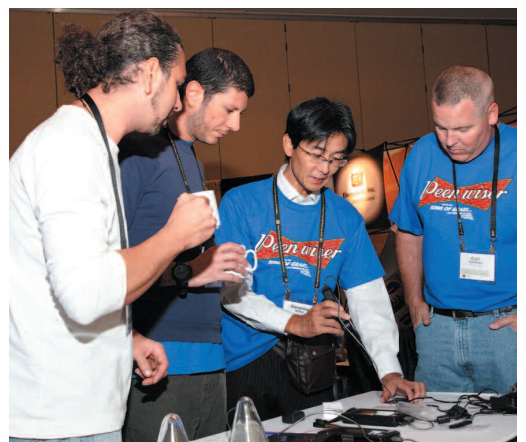
A Coverage Checker demonstration at the 2010 U.S. EI Shot Peening Workshop.