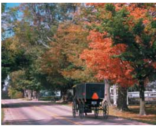
Travel just a few miles out of South Bend and you're in Amish country. ICSP-11 attendees will be able to travel the Amish countryside and visit the Amish Acres Historic Farm.