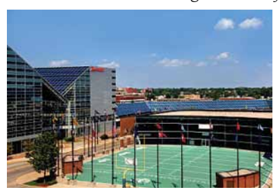
The College Football Hall of Fame is across the street from the Mariott.

ICSP-11 attendees are invited to Electronics Inc., home of the MagnaValve and numbered Almen strip, for a tour and hospitality.