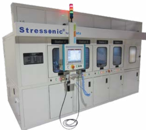
Stresstonic® USP automated 4-station machine for automotive output shafts

USP machines have the following automated functions: robotized handling directly from the previous process operation, media counting (in units or in grams), sonotrodes and media wear-out monitoring, operator warning when lifetime is reached, automated media loading/unloading for each independent workstation, global supervision and periodic quality report issuance. In lower production rate applications, semi-automated solutions are solicited with manual handling of the part through easily accessible windows.