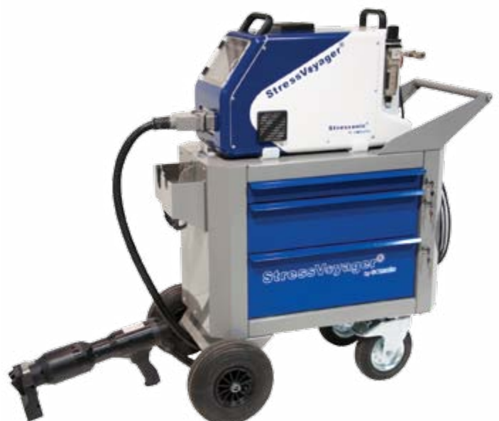
StressVoyager® portable USP equipment on a storage trolley