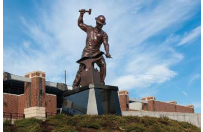
Unveiled in 2005, The Boilermaker statue pays tribute to the origin of the moniker given to the Purdue football team in 1891 after "the burly boiler makers" thrashed Wabash College 44-0.

For those of you looking at travel this far out, there is now a direct air service from Chicago-O'Hare to West Lafayette (airport code LAF), so getting here may be even easier than we had anticipated. ●