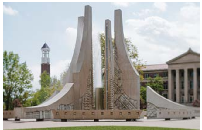
The Engineering Fountain is positioned in the heart of campus on the Purdue Mall.