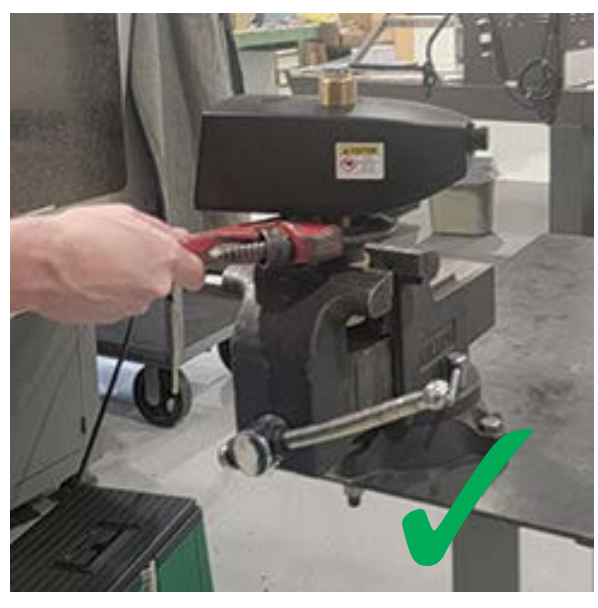
Do mount the pipe fitting in a vise and use one pipe wrench on the valve pipe to attach or remove the pipe fitting.