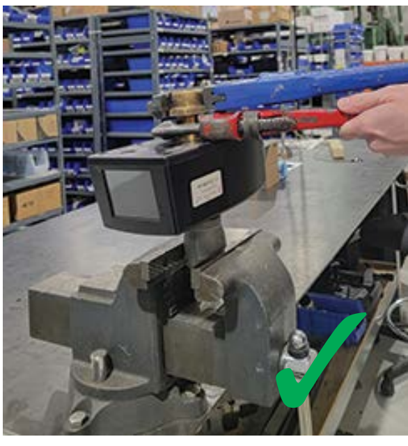
Do use two pipe wrenches—one on the valve pipe and one on the pipe fitting.