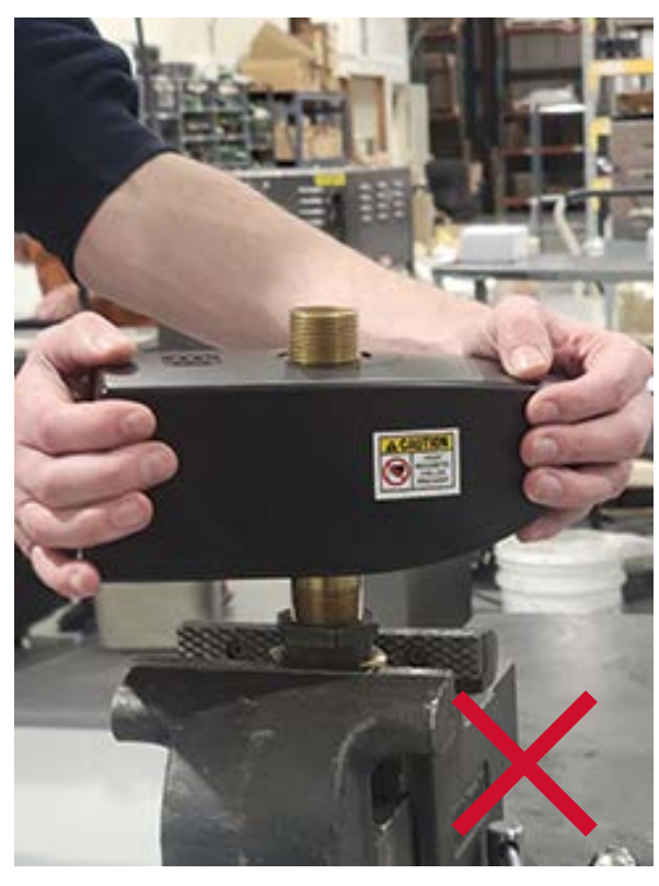
Do not use the valve body as a wrenching surface. This can break the valve.